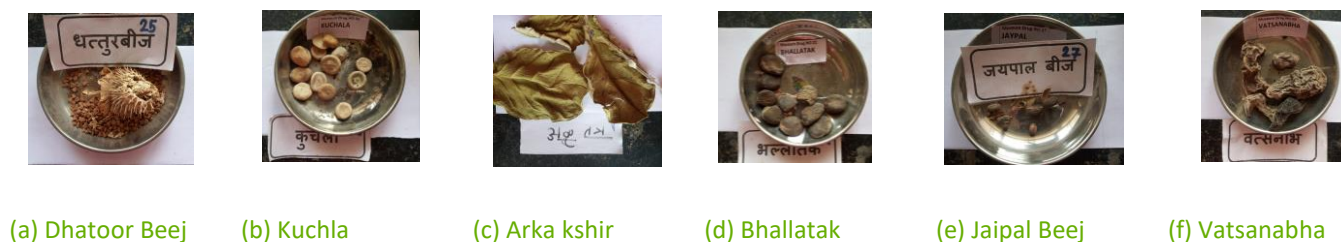
Figure 1. Sthavar Vish (Plant Origin Poisons)

Ayurveda is the science of life which deals with Health of healthy person as” swasthasya swasth rakshanam also in next quotation making a ill person healthy as “Aturasya Vikar Parshamanam” with these both concepts Ayurveda dealing with life science over all concepts of Ayurveda were Categorized in-8- branches, are said to be Ashtangas of Ayurveda. Out eight branches Aagad tantra is one dealing with knowledge of visha (poisoning). vishbadha (poisoning) is life threatening situation that can be considered as present day - Emergency, condition and needs Emergency management that is Attyaik chikitsa. According to classical ayurveda texts, visha (Poison) is mainly categorized in two types, one is sthavar visha (plant origin) and second &- Jangam visha (Animal & Insect origin). As in the ancient time humans were very close to the natural environment. So, they were more exposed to being contaminated with- Sthavar (Plant Origin Poisons) & Jangam vish (Animal Origin Poisons) Badha. If at that time Acharya mentioned the line of treatment management of vish badha as vish chikista to strengthen the exploring to Aushadhi kalp; (Chikista Yog)- will be helpful in now a day to strength society day to day life.