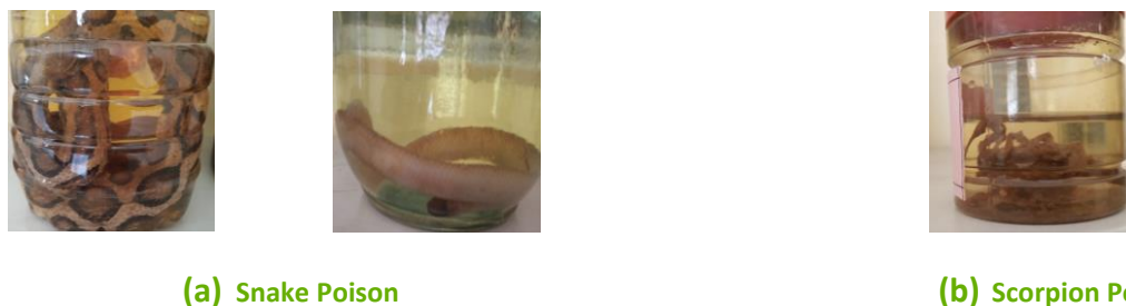
Figure 2. Jangam Vish (Animal Origin Poisons)