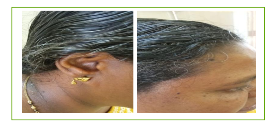
Figure 2. After Treatment